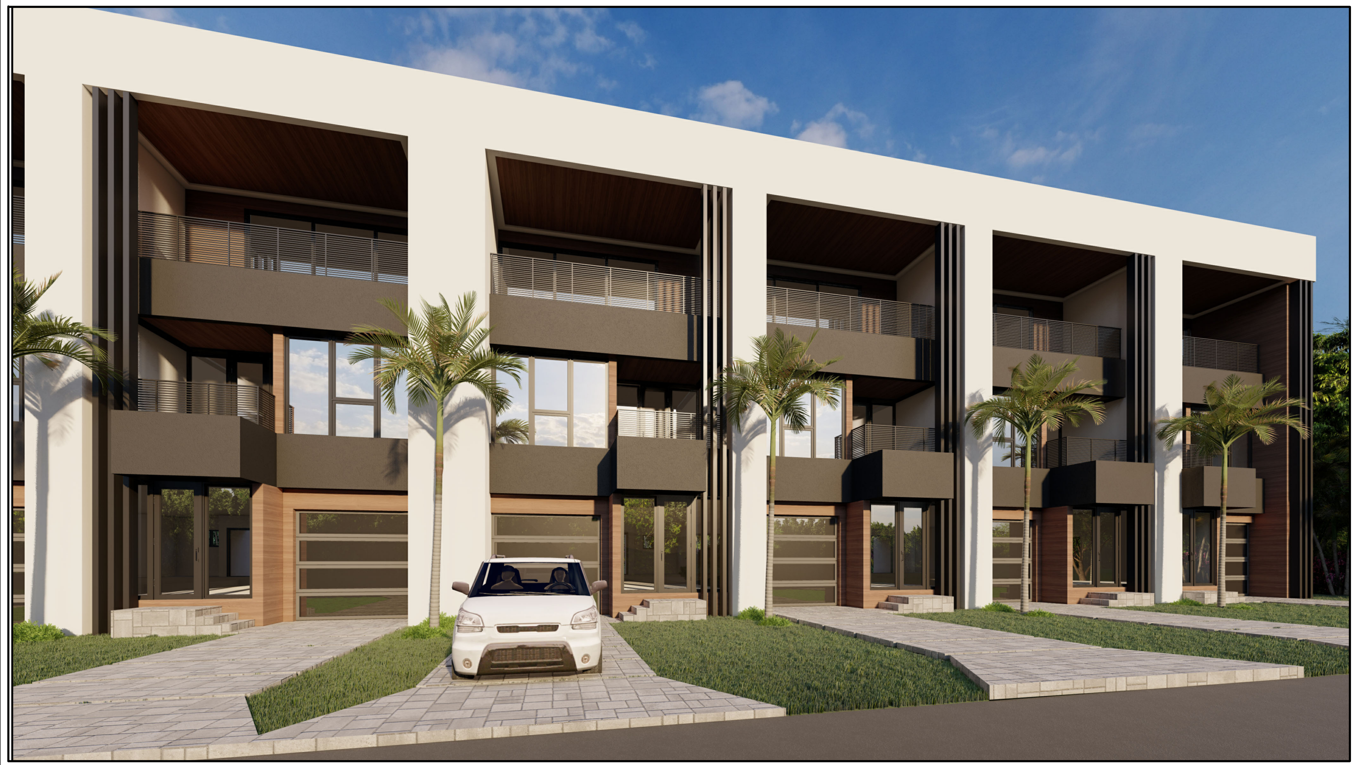
3D IMAGES - FRONT ENTRY SCALE: NOT TO SCALE