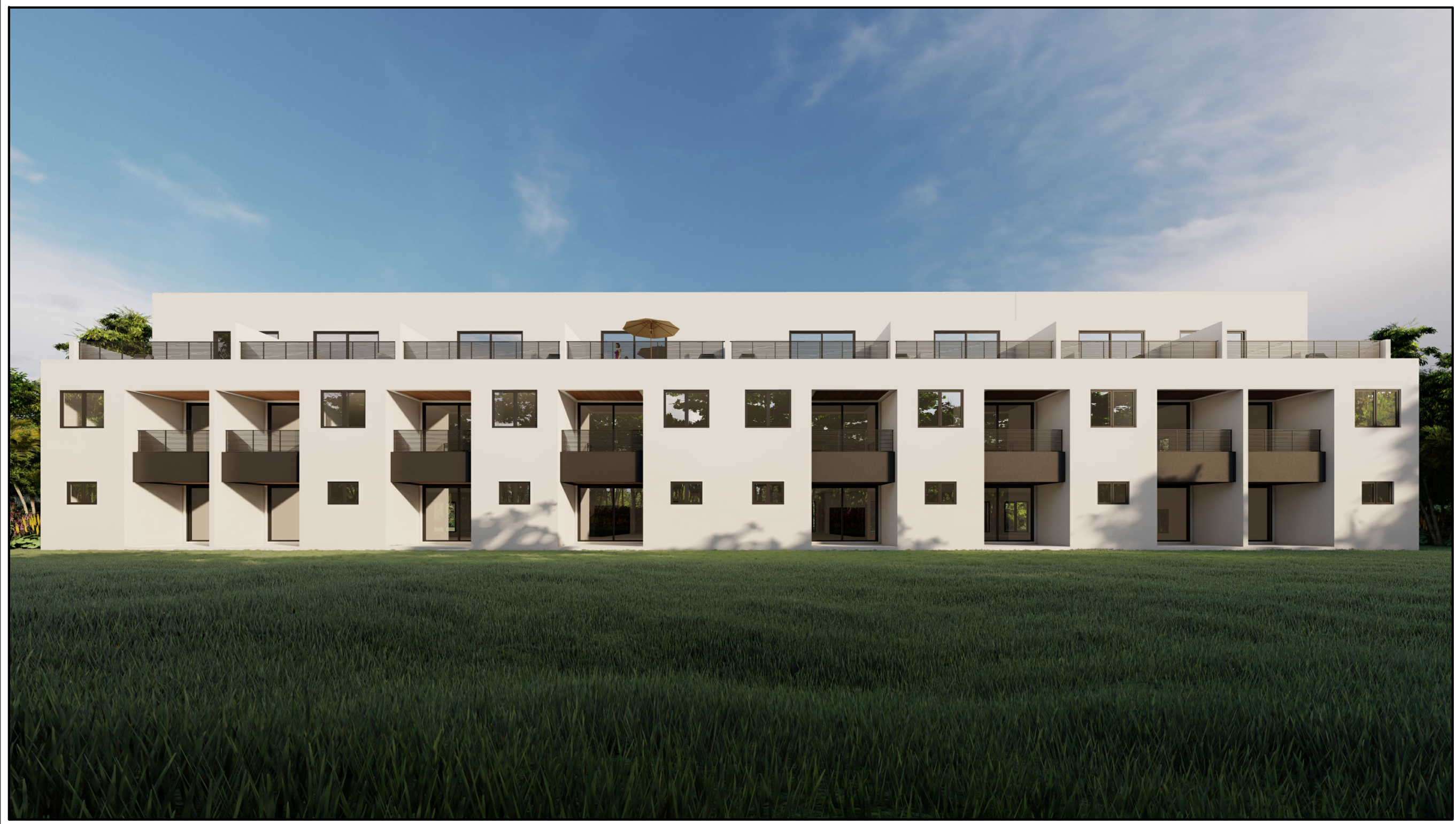
3D IMAGES - REAR SCALE: NOT TO SCALE