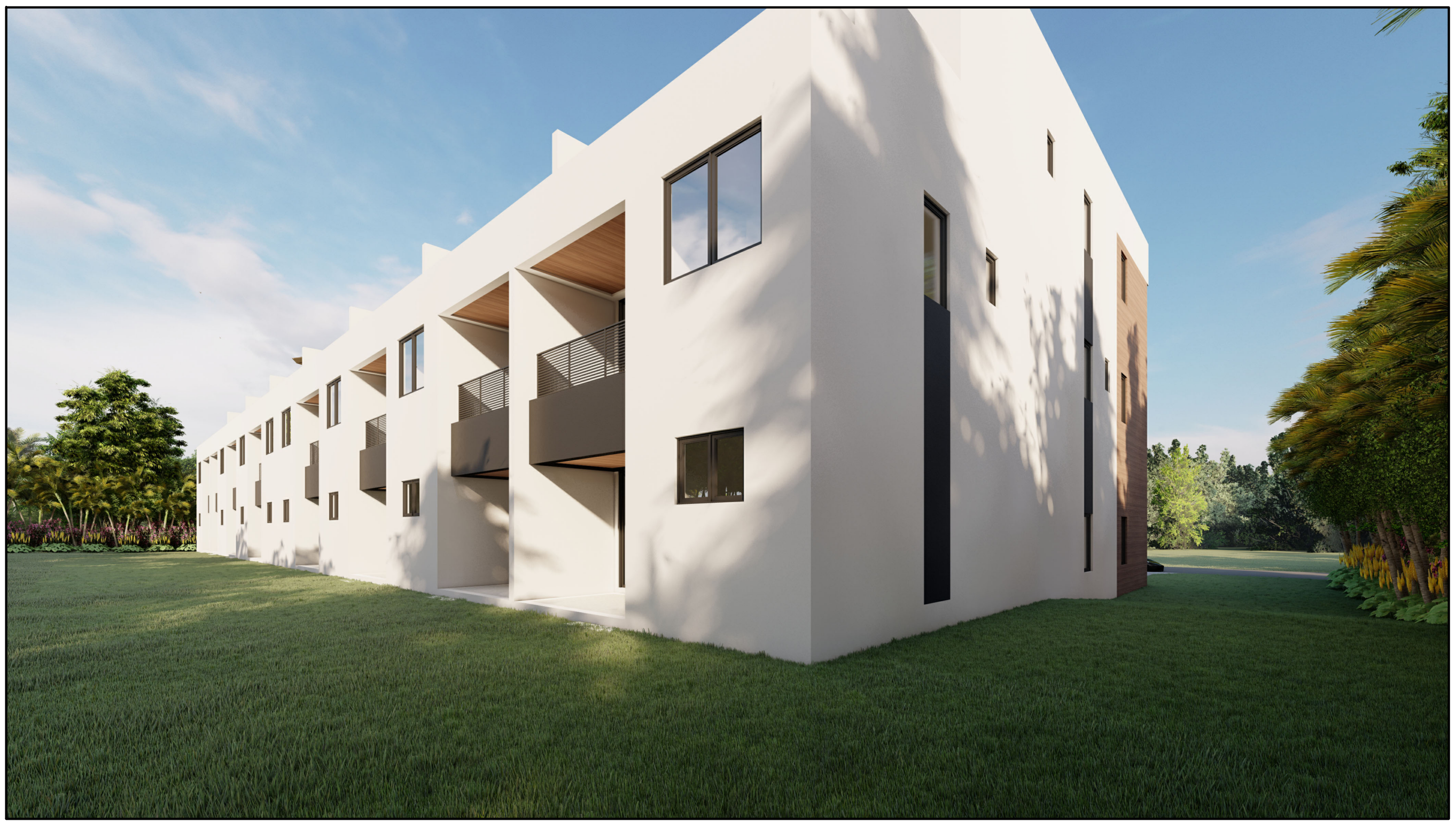
3D IMAGES - REAR RIGHT CORNER SCALE: NOT TO SCALE