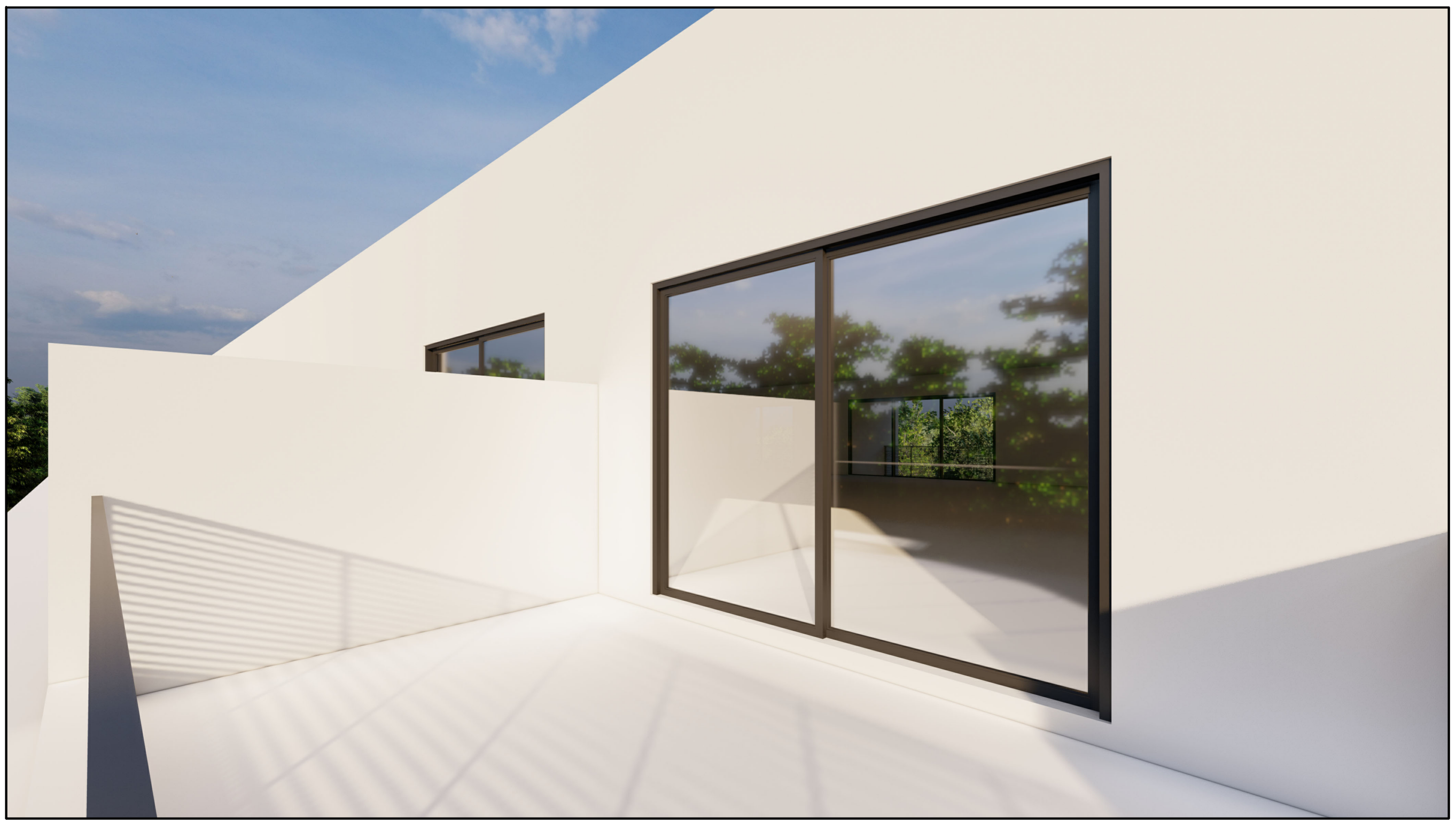
3D IMAGES - REAR ROOF DECK SCALE: NOT TO SCALE